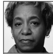
Deliberation, a different way to talk.